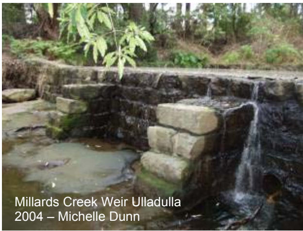
Millards Creek Weir Ulladulla 2004