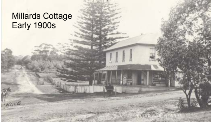
Millards Cottage Early 1900s